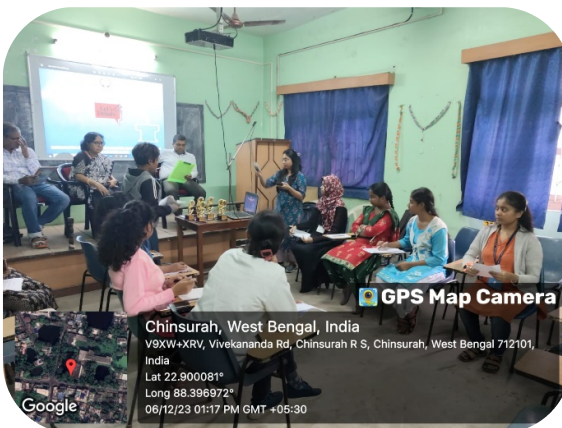
GPS Map Camera Chinsurah, West Bengal, India V9XW+XRV, Vivekananda Rd, Chinsurah R S, Chinsurah, West Bengal 712101, India Lat 22.900081° Long 88.396972° 06/12/23 01:17 PM GMT +05:30