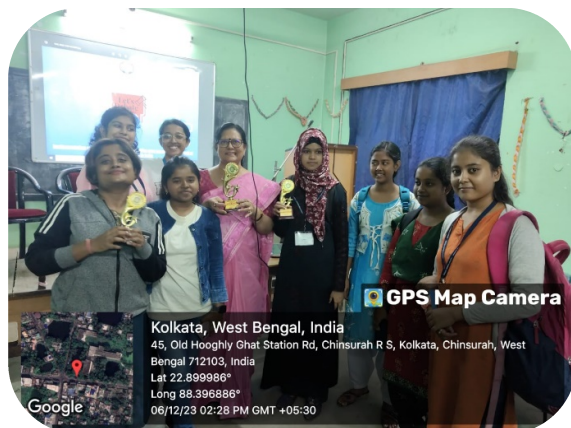
GPS Map Camera Kolkata, West Bengal, India 45, Old Hooghly Ghat Station Rd, Chinsurah R S, Kolkata, Chinsurah, West Bengal 712103, India Lat 22.899988° Long 88.396886° 06/12/23 02:28 PM GMT +05:30