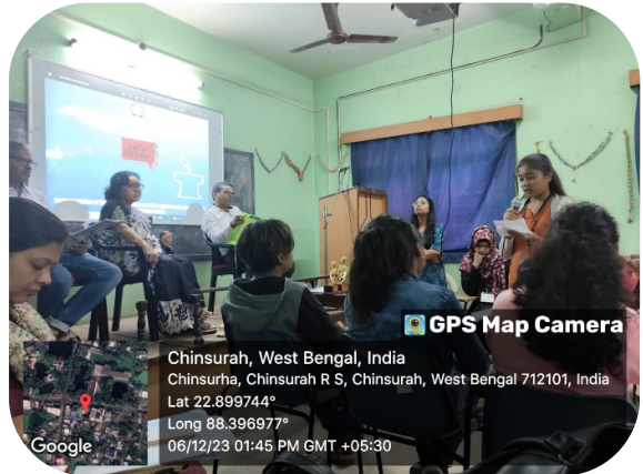
GPS Map Camera Chinsurah, West Bengal, India Chinsurha, Chinsurah R S, Chinsurah, West Bengal 712101, India Lat 22.899744° Long 88.396977° 06/12/23 01:45 PM GMT +05:30