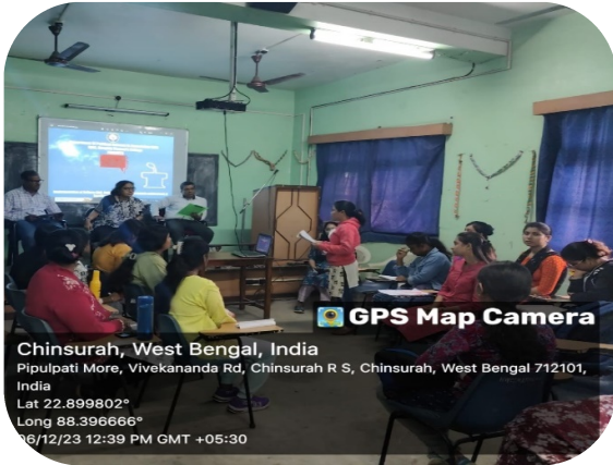
GPS Map Camera Chinsurah, West Bengal, India Pipulpati More, Vivekananda Rd, Chinsurah R S, Chinsurah, West Bengal 712101, India Lat 22.899802° Long 88.396666° 06/12/23 12:39 PM GMT +05:30