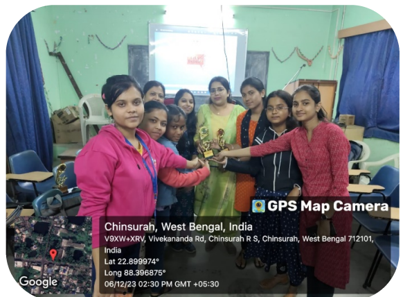
GPS Map Camera Chinsurah, West Bengal, India V9XW+XRV, Vivekananda Rd, Chinsurah R S, Chinsurah, West Bengal 712101, India Lat 22.899974° Long 88.396875° 06/12/23 02:30 PM GMT +05:30